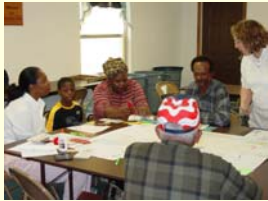
Macedonia Baptist Church