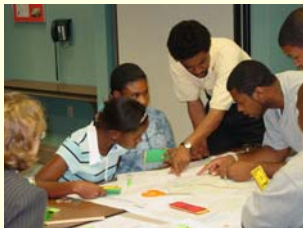
Bethune Cookman College Transportation Institute (Sponsored by FHWA)