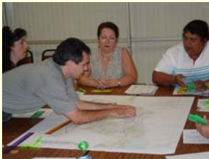
Hispanic Association of Volusia County