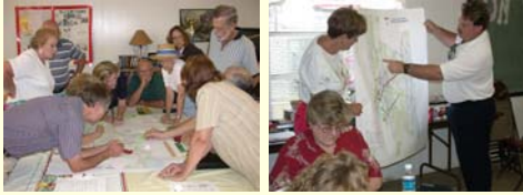
City of Orange City