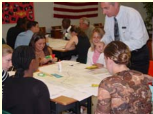
Atlantic High School (Law and Government Academy)