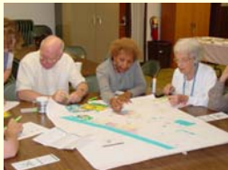
Deltona United Church of Christ