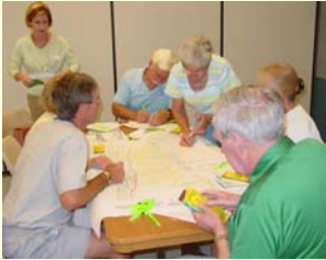
Happy Wanderer's Walking Club