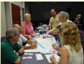
Handicapped Adults of Volusia County (HAVOC)