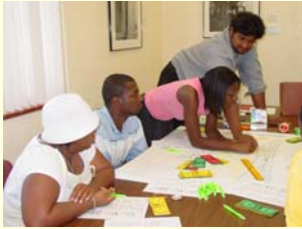
Bethune Cookman College